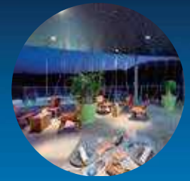
Hilton Resort & Spa