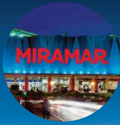
Shopping Centre Miramar